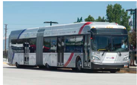
Figure 2. Articulated Bus

Hybrid buses could be considered by UTA as a bus option if they can be designed to meet the requirements of the steep mountain grades, maneuverability at the resorts, and chains.